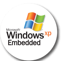
Microsoft Windows XP Embedded