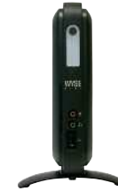
Wyse V50LE Featuring Wyse Linux v6.