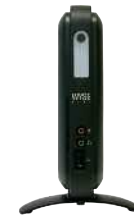
Wyse V90LE Featuring Microsoft Windows XP embedded.