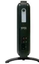
Wyse V30LE Featuring Microsoft Windows CE.