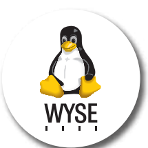
Wyse Linux v6