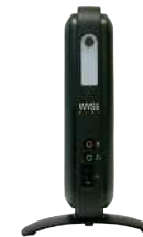
Wyse V90LEW Featuring Microsoft Windows Embedded Standard.