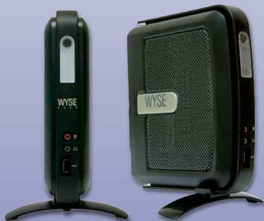
Wyse V class