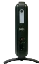
Wyse V00LE Cloud PC for use with Wyse WSM