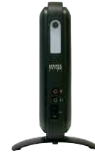
Wyse V10LE Wyse ThinOS for fast boot up times.