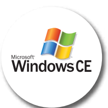
Microsoft Windows CE