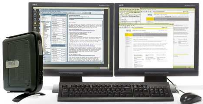
Wyse V class: Features fast boot-up times and dual display option.

Powerful energy saving CPUs are at the heart of Wyse V class' expandable but compact size that features a host of connections including DVI for crisp displays and a unique monorail mounting system allowing the device to be mounted under desks, to walls and even to the rear of desktop monitors.